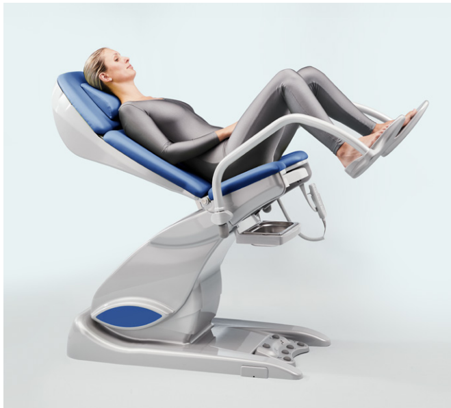
FOOT SUPPORTS WITH INTEGRATED HANDLE