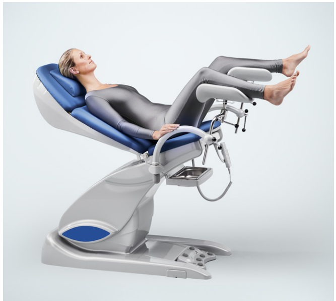
LEG SUPPORTS, GÖPEL TYPE, WITH INTEGRATED HANDLE